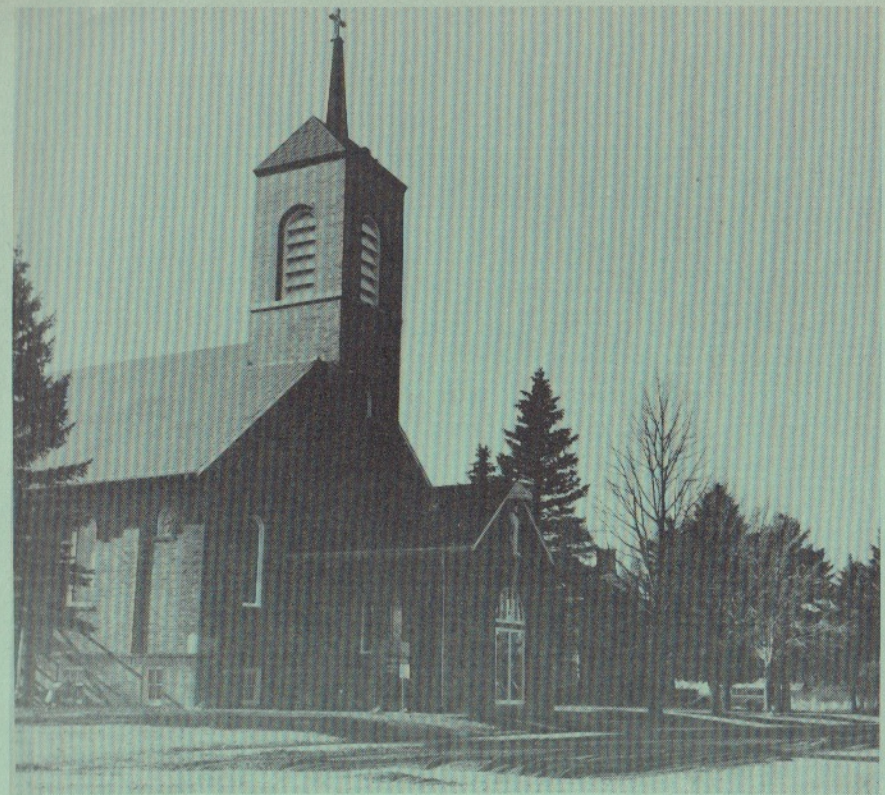
ST. JOSEPH'S CHURCH

They make the publication of this Bulletin possible.