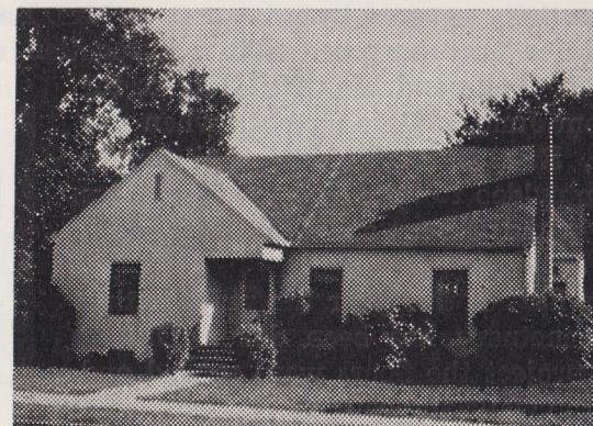
The Church Parsonage