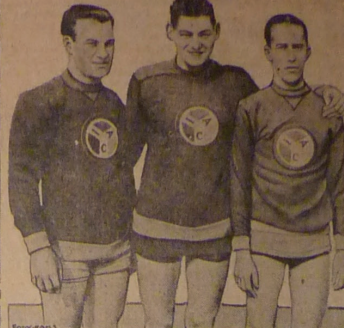
Johny Weissmuller, world's champion swimmer, with other noted aquatic stars, at Miami Beach, Fla., where they are keeping themselves in condition for the summer season.