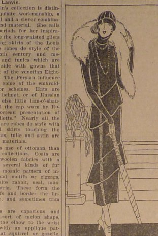
Black Velvet, Furbie, featuring Circular Fur, Tight Sleeves. Caps are made in every conceivable material and of every purpose.

various forms and in many models is a wide cross-section and covers many lines. This is due to the fact that the various forms and in many models is a wide cross-section and covers many lines. This is due to the fact that the various forms and in many models is a wide cross-section and covers many lines.