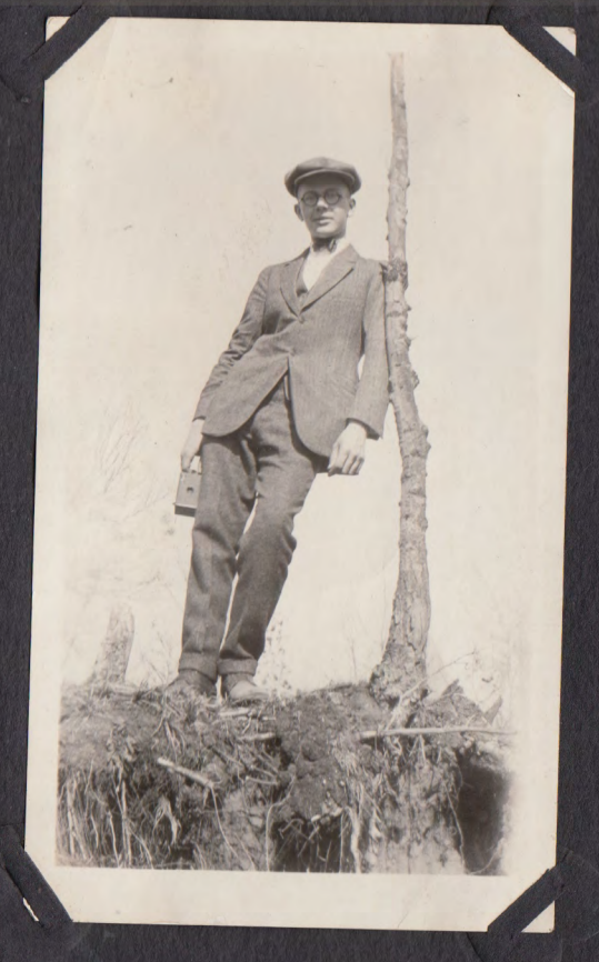
Up a ways on Fower Snake