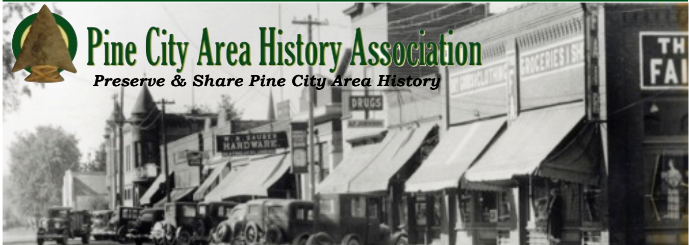
Pine City about 1936