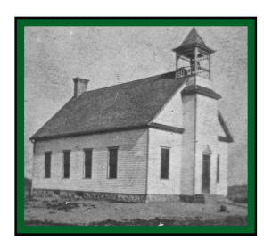
Pine Grove School 1909