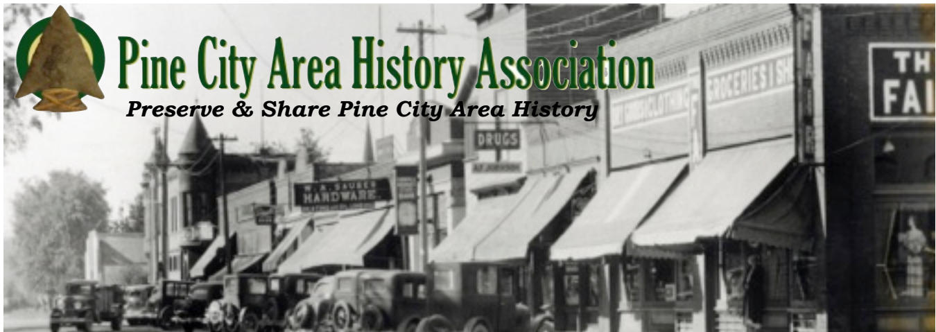
Pine City about 1936