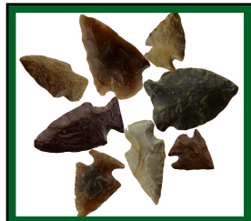
Points from the Joe Neubauer Collection